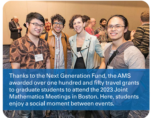
Thanks to the Next Generation Fund, the AMS awarded over one hundred and fifty travel grants to graduate students to attend the 2023 Joint Mathematics Meetings in Boston. Here, students enjoy a social moment between events.

With the generous help of an anonymous benefactor and many other AMS donors, the Campaign for the Next Generation raised $3 million to create an endowment to help graduate students and early career mathematicians as they establish their professional lives. The Next Generation Fund provides funding for the AMS Graduate Student Travel Grant program and as it grows, will provide secure, dedicated support to influential career-building programs including Mathematics Research Communities, AMS Employment Center, JMM Child Care Grants, and AMS Graduate Student Chapters. A top AMS priority, the Fund is designed to adapt to future needs and will support many individuals each year at modest but impactful levels.